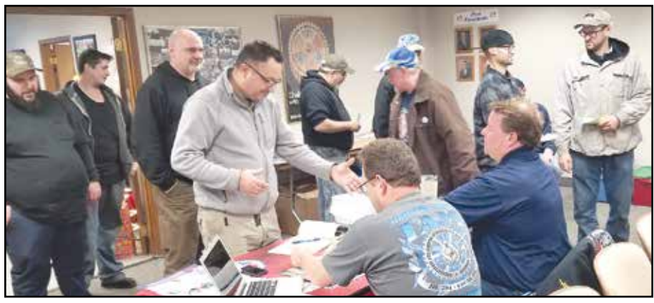
Machinists Union members from ASC picking up ballots to vote on a new agreement that was accepted by default when the strike vote fell short of the two-thirds requirement. Members will see raises each year of the contract, increased 40\overline{1}(k) match each year and other improvements, but objected to revisions to mandatory overtime language.