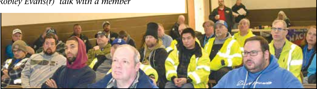
Third shift members filled the Renton town hall meeting early on Feb. 16.