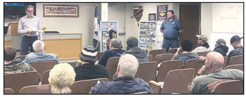
Union leaders explain the contract offer to members prior to the vote on Dec. 20.