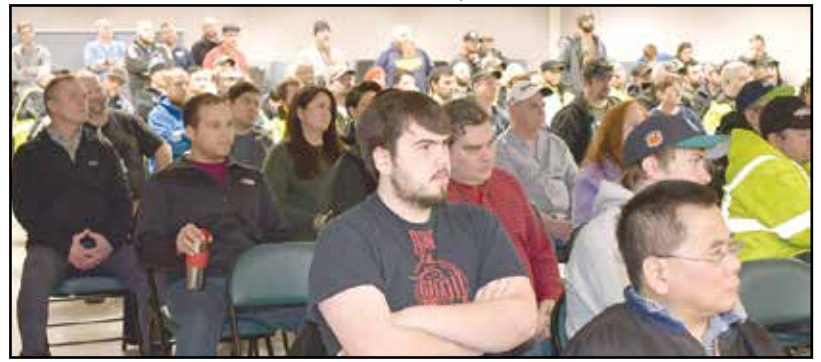
Members at the noon town hall meeting in Everett.